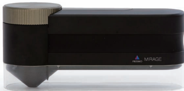
Spectrophotometer- Color Analyzer PMG-001